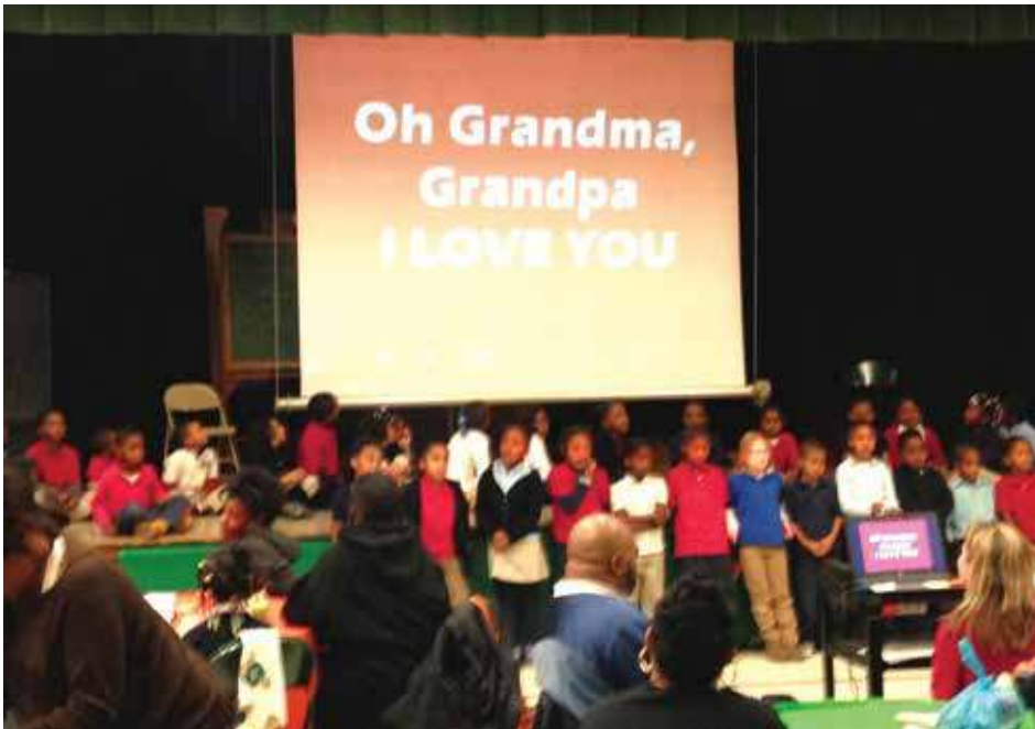
Kelly School's Student Council and staff hosted a successful Grandparents Day with enjoyable presentations and performances and a great turnout.